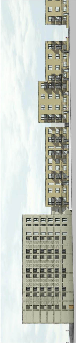
1 West Elevation Block 4