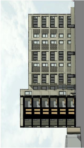
2 South Elevation Block 4