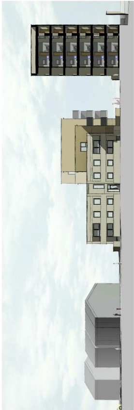
3 North Elevation Block 3