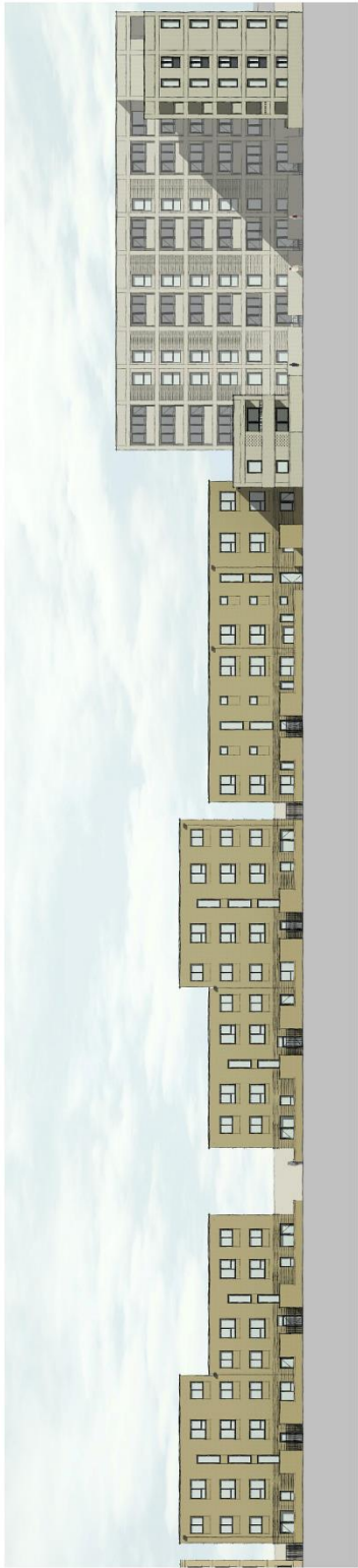
1 East Elevation Blocks 1, 4