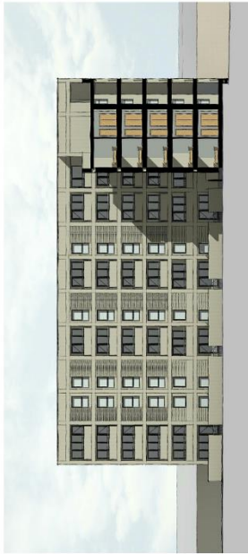
2 East Elevation Block 4